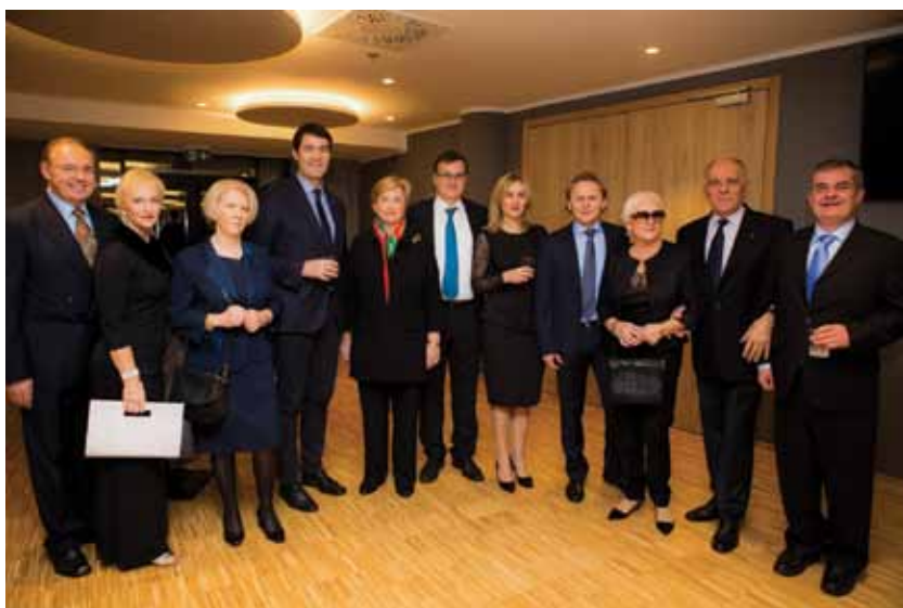
Figure 4. Ceremony marking the 100 th anniversary of the founding of the Faculty of Medicine of the University of Zagreb, 2017 – Hedvig Hricak receiving acknowledgement (up); Hedvig Hricak with invited guests at the festive dinner (down)