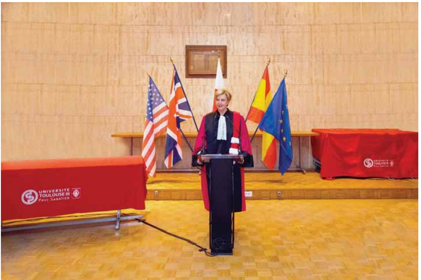
Figure 2. Honorary doctorates of the Ludwig Maximilian University, Munich (up) and the Toulouse III, Paul Sabatier University