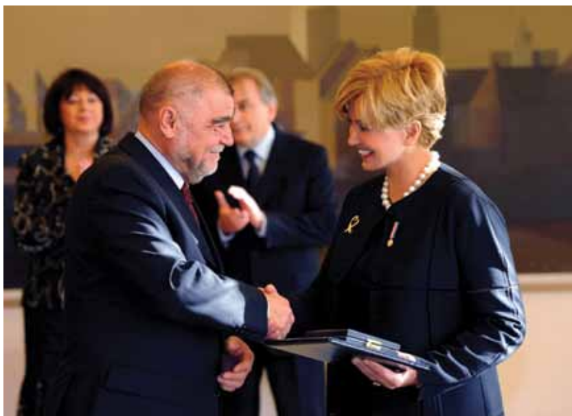
Figure 3. Stjepan Mesić, President of the Republic of Croatia, decorated Hedvig Hricak with the Order of the Croatian Star with the Effigy of Katarina Zrinska