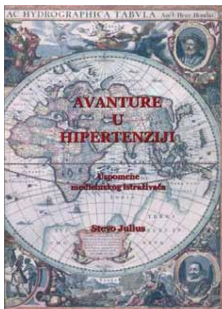
Figure 2. Stevo Julius: Avanture u hipertenziji: uspomene medicinskog istraživača / Adventures in Hypertension: Memoirs of a Life in Medical Science , Samobor, A. G. Matoš, 2011