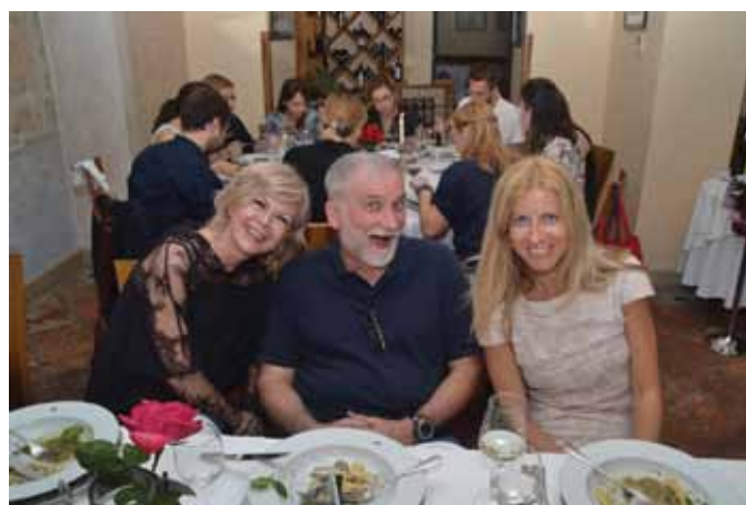
Figure 6. Several images from a couple of Ljudevit Jurak symposia (collage). It is always nice to meet old, and make new friends.