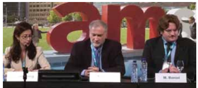
Figure 4. European Cancer Congress 2013 (ECCO-ESMO-ESTRO). Here in this picture at the news conference, I am discussing a study on the importance of molecular profiling in evaluation of cancers of unknown primary (CUP).