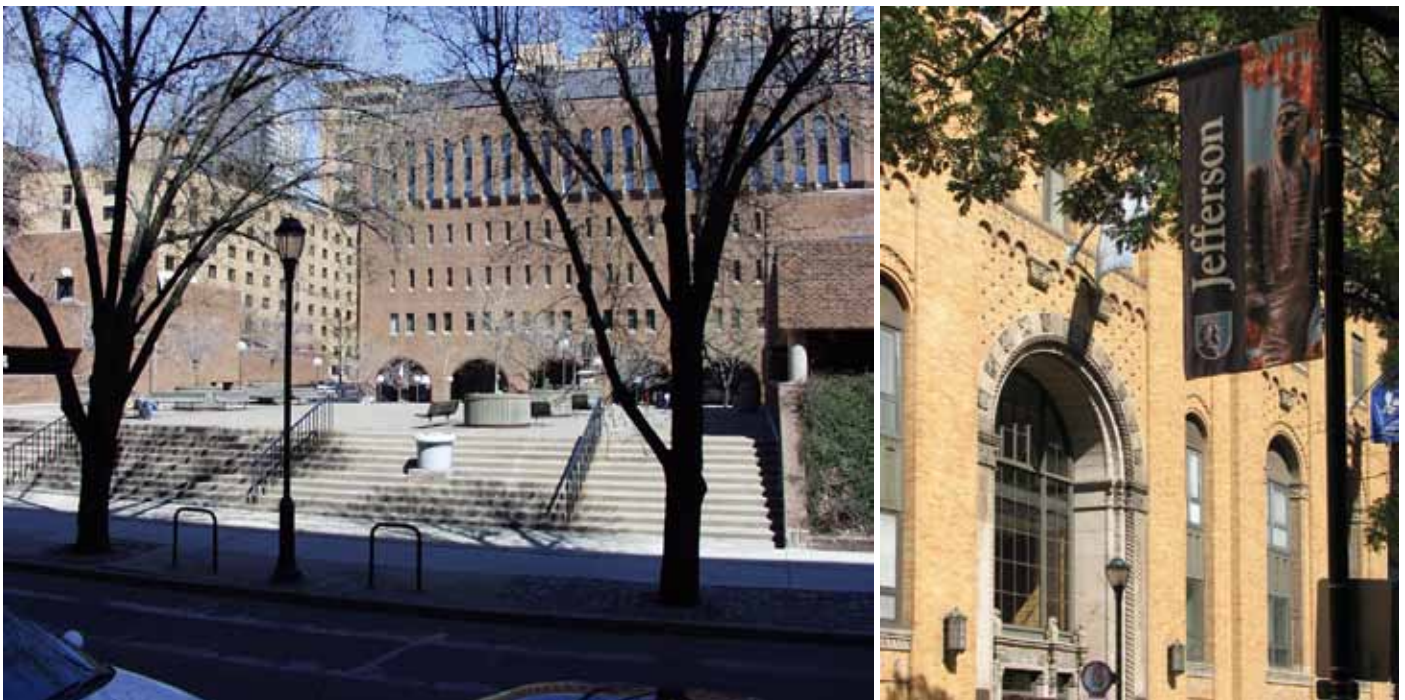
Figure 2ab. Thomas Jefferson University, Philadelphia. I started as a postdoc in 1990 and later completed my residency training in pathology in 1996.