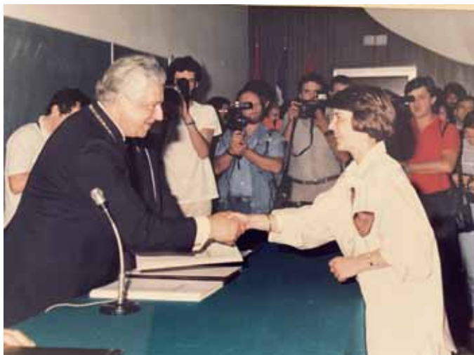
Figure 1. Graduation ceremony at Zagreb Medical School in 1986 with Prof Mijo Rudar