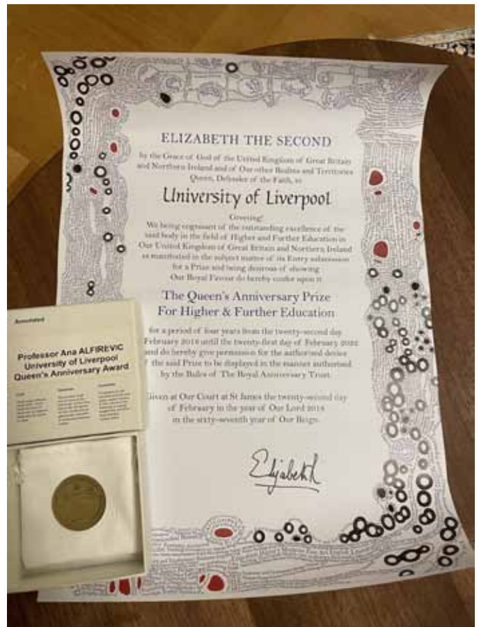
Figure 8. The Department of Pharmacology received the Queens Anniversary Prize for Higher and Further Education (2018-2022), the prize, which is the highest accolade for any academic institution

I regard very highly research that goes on in pharma industry. I have learned a lot from them about regulatory science and drug safety reporting. We also benefited from their expertise in statistical genetics. That said, we need more pre-competitive collaborations. Our most exciting work came from collaborations with competing pharma companies. They had to agree to join forces to develop a solution for a problem that they all share, and from which none of them would gain a competitive advantage. One such example in the biggest collaborative project that I contributed to, funded by the Innovative Medicines Initiative (IMI) an EU grant giving body. The aim of the project was to improve tests for liver toxicity in early drug development. Twelve big pharma companies, four small to medium-size enterprises (SMEs) and ten EU universities were partners in this £32 million project.