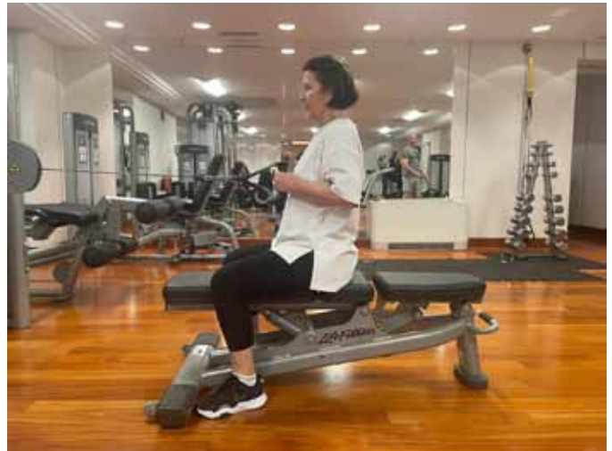
Figure 12. Keeping fit in the Health Club Esplanade, Zagreb

It was necessary to attend formal education for undergraduate teaching at the University of Liverpool for all academic staff members. Every Lecturer had to demonstrate that they acquired theoretical pedagogical knowledge and to have several formal