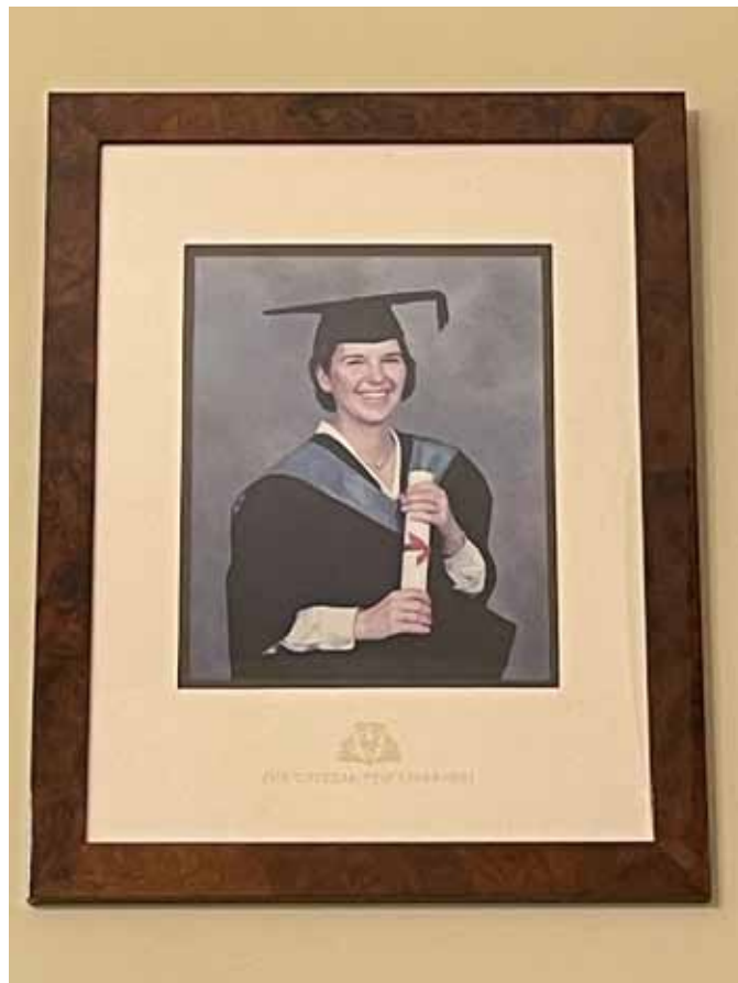
Figure 2. Masters Degree - MSc in Pharmacology at the University of Liverpool in 1997

I was interested in both, pre-clinical and clinical Pharmacology very early on. When I was working at the Department of Oncol-