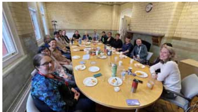
Figure 9. Liverpool in 2023 after I retired from the University

I am Senior Editor of the British Journal of Clinical Pharmacology and I serve on the editorial board of two other journals - Pharmacogenomics and Journal of Personalised Medicine. There are many invitations to join different editorial boards and I select these roles very carefully as editorial duties require a lot of work and dedication. If you want to do editor's job properly, by which I mean being fair to all hard-working researchers that submit papers to your journal, you need to have time and make an effort. I have had many rejected papers in my career, and I am fully aware of the impact this may have, particularly on young researchers. This is the reason why I expect such high standards from myself and my fellow editors. We are all genuinely interested in great research, and we want to see it published as soon as possible.