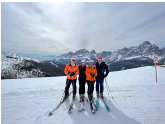
Figure 12. With family skiing

our students had to communicate the risks to their patients and their siblings. We used actors instead of real patients which was great fun. The teaching on risk and probabilities was done in collaboration with the Harvard University and Massachusetts General Hospital Clinician Training leads. Our key learning outcomes were ability to synthesise complexity, uncertainty and risk to facilitate shared decision making with patients focusing on acute medical care.